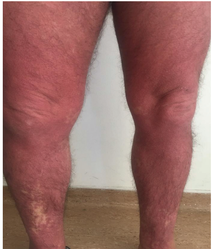
Figure 2. Erythematous maculopapular rashes on both of the patient's lower extremities

Currently, the indications for allopurinol therapy are hyperuricemia (gouty arthritis, urate nephropathy, nephrolithiasis) and prophylaxis against urate nephropathy during chemotherapy for neoplastic diseases. Allopurinol