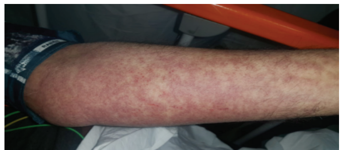
Figure 3. Erythematous maculopapular rash on the patient's upper extremity